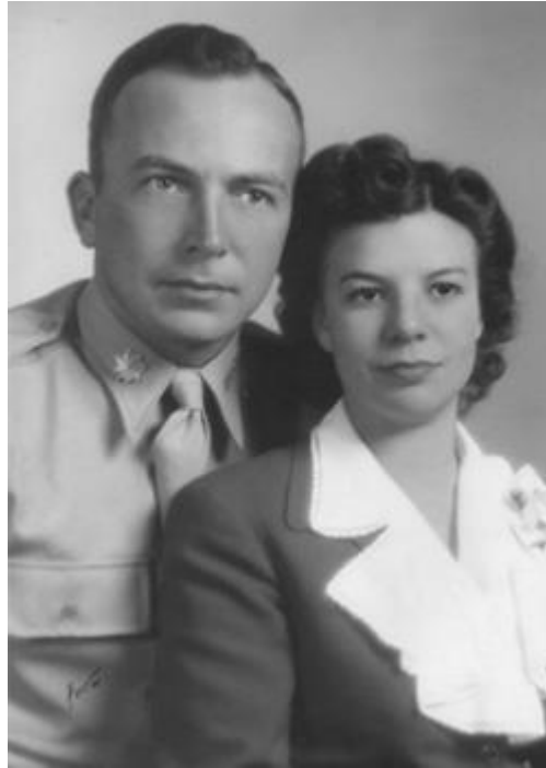
Truman and Margaret