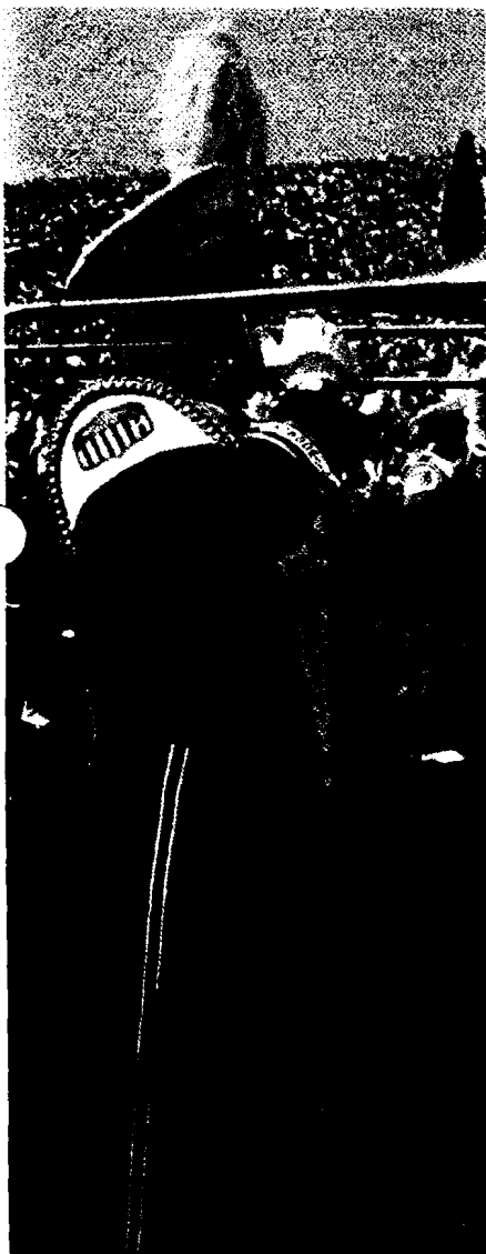
UNIVERSITY OF MICHIGAN

U.S.C. (University of Southern California)