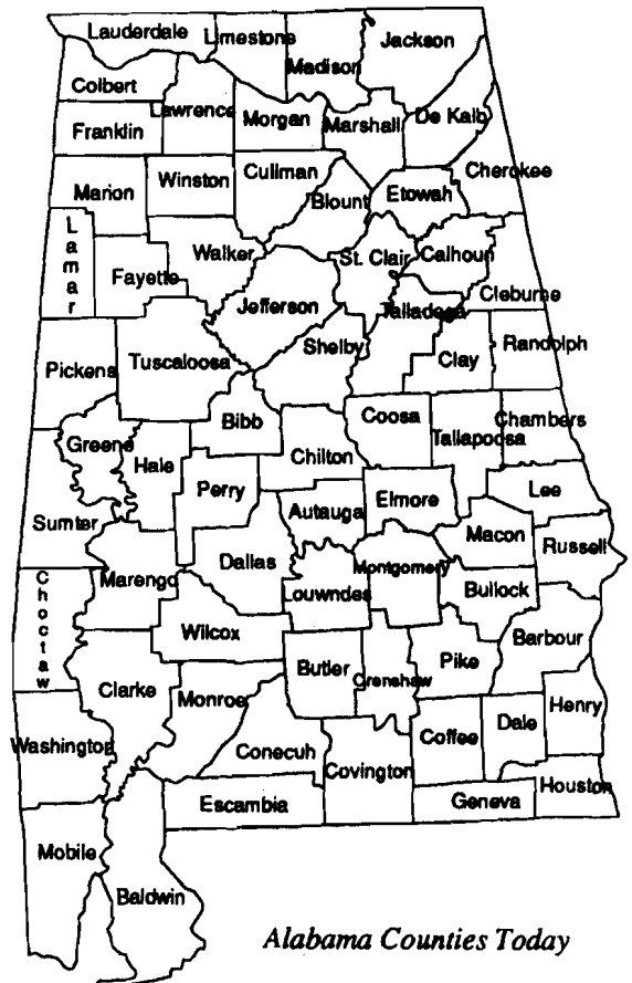
Alabama Counties Today